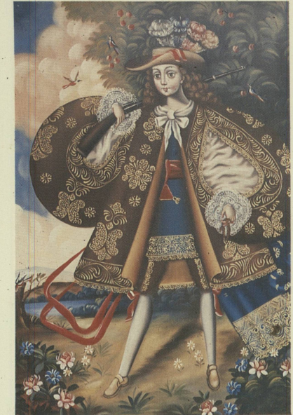
'Nobleman in court array'

Peruvian Arts has a collection of unique and original paintings from the Andean mountains of South America. Looking at them, it seems that time has stood still since the days of the Conquistadors, and the period of Spanish colonial occupation of South America. They are painted by Peruvian Indian artists, who produce these very delicate and complicated paintings using a technique which has been executed without interruption (though in small numbers) since the 16th Century. Executed in a beautiful Spanish baroque manner, they blend 16th Century European sophistication with a more primitive local style. As the 20th Century draws to a close, the art of painting these gems is disappearing fast; Peruvian Arts has collected many of the finest works by the three top artists, prior to their recent retirement.