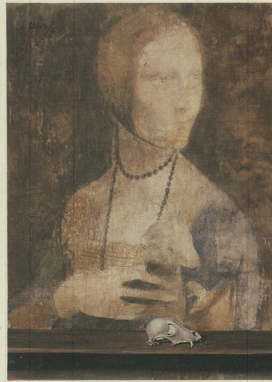
'Una Cierta Sonrisa: Imagen de Leonardo', 1989.