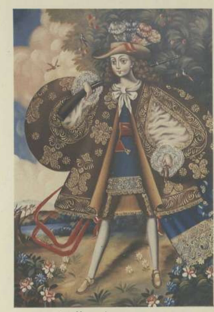
'Nobleman in court array

Peruvian Arts has a collection of unique and original paintings from the Andean mountains of South America, Looking at them, it seems that time has stood still since the days of the Conquistadors, and the period of Spanish colonial occupation of South America. They are painted by Peruvian Indian artists, who produce these very delicate and complicated paintings using a technique which has been executed without interruption (though in small numbers) since the 16th Century, Executed in a beautiful Spanish baroque manner, they blend 16th Century European sophistication with a more primitive local style. As the 20th Century draws to a close, the art of painting these gems is disappearing fast; Peruvian Arts has collected many of the finest works by the three top artists, prior to their recent retirement